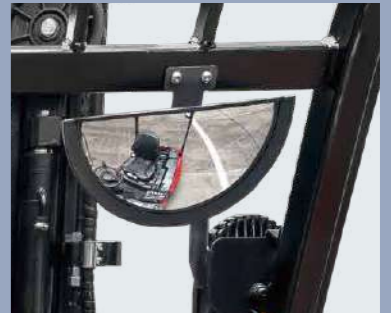
Panoramic rearview mirror