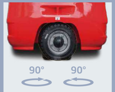
The small turning radius is suitable for narrow channel