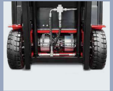
Front dual separated motors